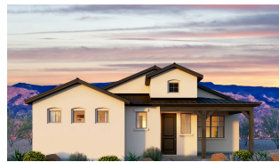
Northern New Mexican