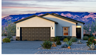
Craftsman with Stone Elevation

Homes may be built in reverse of plans shown, depending on site conditions. Minor architectural changes may be made occasionally at the option of the builder. Printed material is not date stamped. Prices are subject to change. Please reference Abrazo Homes' website for most updated and accurate pricing and information. Please contact your Sales Consultant for details.