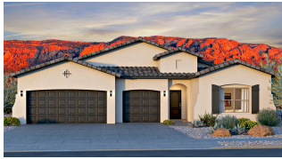
Audrey II Mission - 3 Car Garage - Tile Roof

Enjoy the convenience of a 3-car garage, providing ample storage and parking. Customize your living experience with amazing structural options, including the addition of a 4th bedroom or a junior suite, a cozy fireplace, or stunning oversized sliding glass doors that invite the beautiful sunny New Mexico weather inside. This home is designed to adapt to your lifestyle and needs, offering both comfort and flexibility. In honor of Audrey Hepburn. She remains a beloved and enduring symbol of elegance, kindness, and timeless beauty.