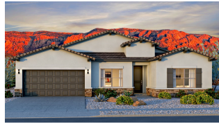
Audrey II Craftsman - Junior Suite - Tile Roof

Homes may be built in reverse of plans shown, depending on site conditions. Minor architectural changes may be made occasionally at the option of the builder. Printed material is not date stamped. Prices are subject to change. Please reference Abrazo Homes' website for most updated and accurate pricing and information. Please contact your Sales Consultant for details.