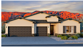
Audrey II Craftsman - 3 Car Garage - Tile Roof