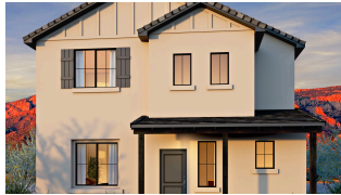
2213 - The Cabernet Farmhouse

Homes may be built in reverse of plans shown, depending on site conditions. Minor architectural changes may be made occasionally at the option of the builder. Printed material is not date stamped. Prices are subject to change. Please reference Abrazo Homes' website for most updated and accurate pricing and information. Please contact your Sales Consultant for details.