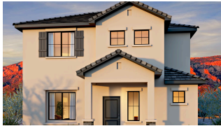
2213 - The Cabernet Cottage

The heart of the home is the large kitchen island that seats four, seamlessly extending into the dining and great rooms—ideal for gatherings. Customize your space with options like a fireplace, an extended buffet in the dining room, or an expanded covered patio. "The Cabernet" promises a home that's as functional as it is inviting.