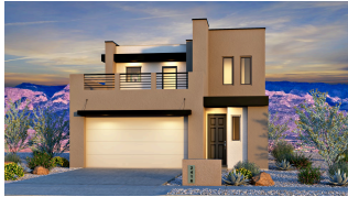
Contemporary Elevation with party deck