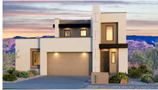
Modern Elevation with flex room

Homes may be built in reverse of plans shown, depending on site conditions. Minor architectural changes may be made occasionally at the option of the builder. Printed material is not date stamped. Prices are subject to change. Please reference Abrazo Homes' website for most updated and accurate pricing and information. Please contact your Sales Consultant for details.