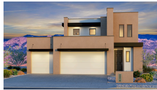
Contemporary Elevation with 3rd car garage