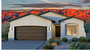
Frida - Mission - Shingle Roof