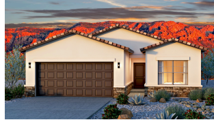
Frida - Craftsman w/Stone - Tile Roof