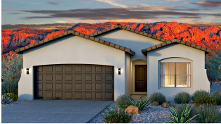
Frida - Mission - Tile Roof

Introducing the "Frida" floor plan, Abrazo's inaugural creation, meticulously refined and perfected over the years. This single-story home features three bedrooms and two baths, seamlessly balancing functionality with affordability. The "Frida" offers a spacious primary bedroom, ensuring comfort and relaxation, and includes a covered porch for outdoor enjoyment. Discover a thoughtfully designed layout that checks all the boxes. In honor of Frida Kahlo, this home pays homage to artistic spirit and timeless allure.