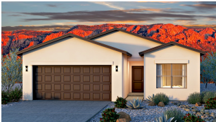
Frida - Craftsman w/Stone - Shingle Roof