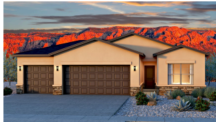
Frida - Craftsman w/Stone; 3 Car - Tile Roof

Homes may be built in reverse of plans shown, depending on site conditions. Minor architectural changes may be made occasionally at the option of the builder. Printed material is not date stamped. Prices are subject to change. Please reference Abrazo Homes' website for most updated and accurate pricing and information. Please contact your Sales Consultant for details.