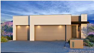
Modern Elevation with 3rd car garage

Homes may be built in reverse of plans shown, depending on site conditions. Minor architectural changes may be made occasionally at the option of the builder. Printed material is not date stamped. Prices are subject to change. Please reference Abrazo Homes' website for most updated and accurate pricing and information. Please contact your Sales Consultant for details.