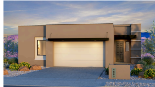
Contemporary Elevation with flex room