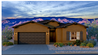
2038_Jane_Craftsman wOut Stone_Shingle_12.10.24