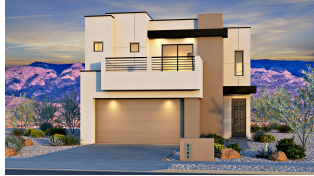
Modern Elevation with open deck