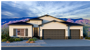
Marilyn II Craftsman Shingle Roof