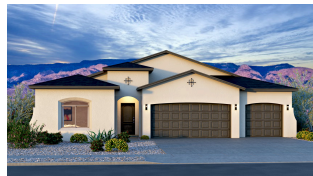
Marilyn II Mission Shingle Roof