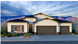
Marilyn II Craftsman Shingle Roof