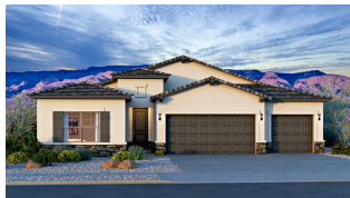
Marilyn II Craftsman Tile Roof