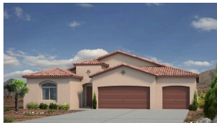
Marilyn II Mission Tile Roof