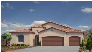
Marilyn II Mission Tile Roof