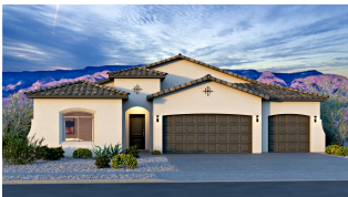
Marilyn II Mission Tile Roof

And with a standard 3-car garage that passes the “F-150 test,” you’ll have all the space you need—inside and out.