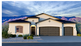
Marilyn II Mission Shingle Roof