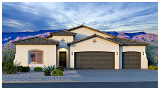
Marilyn II Mission Tile Roof

And with a standard 3-car garage that passes the “F-150 test,” you’ll have all the space you need—inside and out.