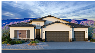
Marilyn II Craftsman Tile Roof