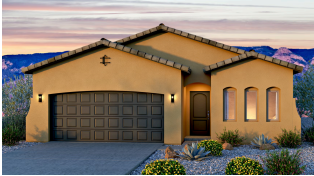
Maya - Mission - TileRoof

Introducing the "Maya" floor plan. This ready-to-be-built home showcases a distinctive elevation, featuring an entertainer's kitchen with a bar top seamlessly connecting to the spacious great room. The primary suite boasts a generous walk-in closet, while optional vaulted ceilings in the great room create a sense of openness. Discover the charm that earned the "Maya" floor plan the prestigious 'Buyer's Choice Award' in the Parade of Homes. In honor of Maya Angelou, this home is designed to inspire and uplift.