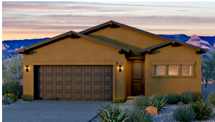
Maya - Craftsman w/Out Stone - ShingleRoof