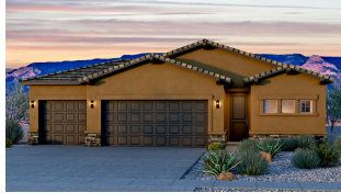
Maya - Craftsman - 3rd Car - TileRoof