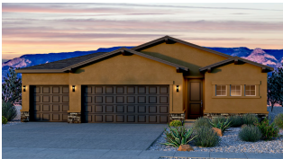
Maya - Craftsman - 3rd Car - ShingleRoof

Homes may be built in reverse of plans shown, depending on site conditions. Minor architectural changes may be made occasionally at the option of the builder. Printed material is not date stamped. Prices are subject to change. Please reference Abrazo Homes' website for most updated and accurate pricing and information. Please contact your Sales Consultant for details.