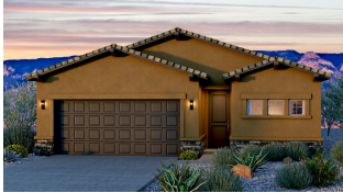
Maya - Craftsman - TileRoof