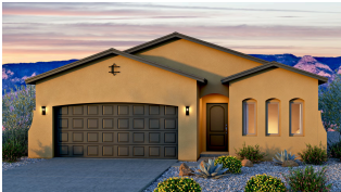
Maya - Mission - ShingleRoof