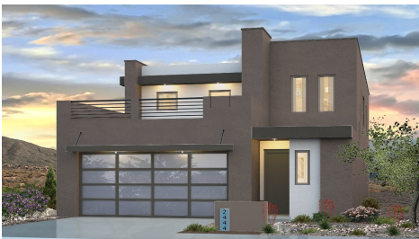
Contemporary Elevation at Hawks Landing

Located at the southern tip of the Baja California Peninsula, Cabo San Lucas, or simply Cabo, is known worldwide for its gorgeous landscape and ultra-luxurious resorts. Skip the crowds, though, and find your own luxurious getaway for you and the family right here in the Cabo floor plan. Being the largest plan in this modern and contemporary lineup, this home offers an owner's suite on the first floor with an optional junior suite and an open deck on the second floor. Towering as prominently as El Arco de Cabo San Lucas, this home is perfect for multigenerational families looking to escape the norm.