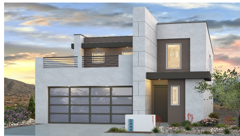
Modern Elevation at Hawks Landing

Homes may be built in reverse of plans shown, depending on site conditions. Minor architectural changes may be made occasionally at the option of the builder. Printed material is not date stamped. Prices are subject to change. Please reference Abrazo Homes' website for most updated and accurate pricing and information. Please contact your Sales Consultant for details.