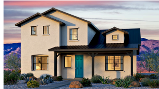
Northern New Mexican Elevation

Homes may be built in reverse of plans shown, depending on site conditions. Minor architectural changes may be made occasionally at the option of the builder. Printed material is not date stamped. Prices are subject to change. Please reference Abrazo Homes' website for most updated and accurate pricing and information. Please contact your Sales Consultant for details.