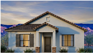
1266 The Chardonnay Cottage

"The Chardonnay" offers more space, more storage, and more style, making every square foot count in creating a home that's not just efficient but also wonderfully inviting. Welcome to your delightful retreat, where every detail is designed for a better way of living.