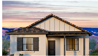
1266 The Chardonnay Farmhouse

Homes may be built in reverse of plans shown, depending on site conditions. Minor architectural changes may be made occasionally at the option of the builder. Printed material is not date stamped. Prices are subject to change. Please reference Abrazo Homes' website for most updated and accurate pricing and information. Please contact your Sales Consultant for details.