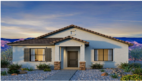
1266 The Chardonnay Cottage

"The Chardonnay" offers more space, more storage, and more style, making every square foot count in creating a home that's not just efficient but also wonderfully inviting. Welcome to your delightful retreat, where every detail is designed for a better way of living.