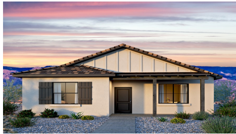
1266 The Chardonnay Farmhouse

Homes may be built in reverse of plans shown, depending on site conditions. Minor architectural changes may be made occasionally at the option of the builder. Printed material is not date stamped. Prices are subject to change. Please reference Abrazo Homes' website for most updated and accurate pricing and information. Please contact your Sales Consultant for details.