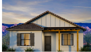
1146 Riesling Farmhouse

Homes may be built in reverse of plans shown, depending on site conditions. Minor architectural changes may be made occasionally at the option of the builder. Printed material is not date stamped. Prices are subject to change. Please reference Abrazo Homes' website for most updated and accurate pricing and information. Please contact your Sales Consultant for details.