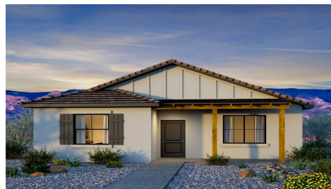
1146 Riesling Farmhouse

Homes may be built in reverse of plans shown, depending on site conditions. Minor architectural changes may be made occasionally at the option of the builder. Printed material is not date stamped. Prices are subject to change. Please reference Abrazo Homes' website for most updated and accurate pricing and information. Please contact your Sales Consultant for details.