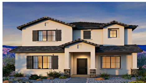
1898 Syrah Cottage

Homes may be built in reverse of plans shown, depending on site conditions. Minor architectural changes may be made occasionally at the option of the builder. Printed material is not date stamped. Prices are subject to change. Please reference Abrazo Homes' website for most updated and accurate pricing and information. Please contact your Sales Consultant for details.