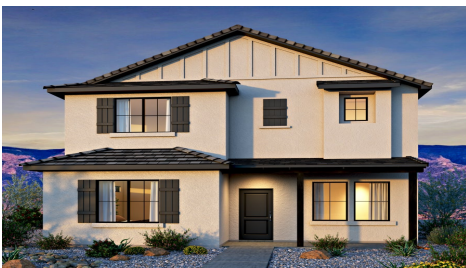
1898 Syrah Farmhouse

Bathed in New Mexico's 300+ days of sunshine, the home features plentiful windows, a large kitchen island, and a spacious great room perfect for gatherings. With various customization options available, "The Syrah" can adapt to meet diverse living needs.