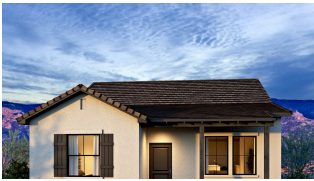
1523 - The Zinfandel Farmhouse

Embrace the elegance and efficiency of "The Zinfandel," where smart design meets contemporary comfort in every detail.