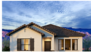
1523 - The Zinfandel Cottage

Homes may be built in reverse of plans shown, depending on site conditions. Minor architectural changes may be made occasionally at the option of the builder. Printed material is not date stamped. Prices are subject to change. Please reference Abrazo Homes' website for most updated and accurate pricing and information. Please contact your Sales Consultant for details.