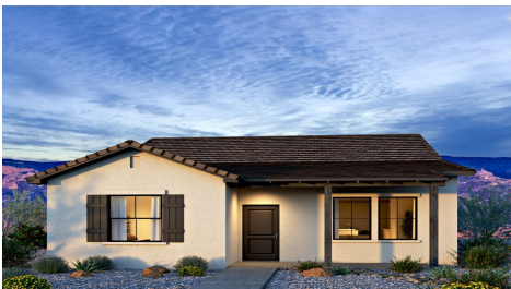
1523 - The Zinfandel Farmhouse

Embrace the elegance and efficiency of "The Zinfandel," where smart design meets contemporary comfort in every detail.