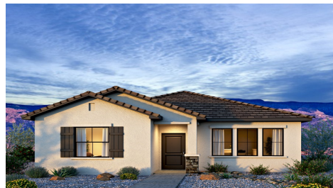
1523 - The Zinfandel Cottage

Homes may be built in reverse of plans shown, depending on site conditions. Minor architectural changes may be made occasionally at the option of the builder. Printed material is not date stamped. Prices are subject to change. Please reference Abrazo Homes' website for most updated and accurate pricing and information. Please contact your Sales Consultant for details.