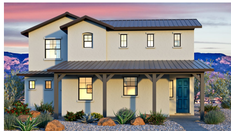
Northern New Mexican Elevation

Homes may be built in reverse of plans shown, depending on site conditions. Minor architectural changes may be made occasionally at the option of the builder. Printed material is not date stamped. Prices are subject to change. Please reference Abrazo Homes' website for most updated and accurate pricing and information. Please contact your Sales Consultant for details.