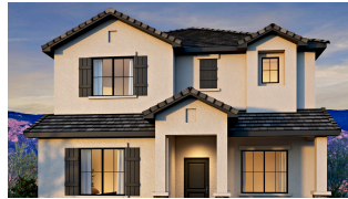
1898 Syrah Cottage

Homes may be built in reverse of plans shown, depending on site conditions. Minor architectural changes may be made occasionally at the option of the builder. Printed material is not date stamped. Prices are subject to change. Please reference Abrazo Homes' website for most updated and accurate pricing and information. Please contact your Sales Consultant for details.