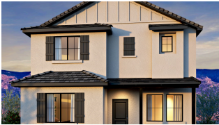
1898 Syrah Farmhouse

Bathed in New Mexico's 300+ days of sunshine, the home features plentiful windows, a large kitchen island, and a spacious great room perfect for gatherings. With various customization options available, "The Syrah" can adapt to meet diverse living needs.