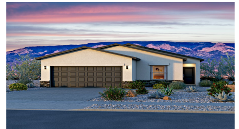
Craftsman with Stone Elevation

Homes may be built in reverse of plans shown, depending on site conditions. Minor architectural changes may be made occasionally at the option of the builder. Printed material is not date stamped. Prices are subject to change. Please reference Abrazo Homes' website for most updated and accurate pricing and information. Please contact your Sales Consultant for details.