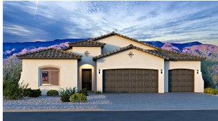
Marilyn II Mission Tile Roof

Introducing the “Marilyn II”, our single-story ranch-style home designed for effortless living and entertaining. This ready-to-build floor plan seamlessly connects a spacious great room to a modern kitchen, creating the ideal space for gatherings. Featuring three bedrooms plus a flexible room, there's ample space for family or guests. Elevate your living experience with the option for a great room extension, and relish outdoor living on the large expanded patio available in many of our communities. Welcome to a home that harmonizes style with practicality. In honor of Marilyn Monroe, this residence celebrates glamor and enduring charm.