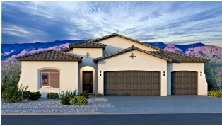
Marilyn II Mission Tile Roof

Introducing the "Marilyn II", our single-story ranch-style home designed for effortless living and entertaining. This ready-to-build floor plan seamlessly connects a spacious great room to a modern kitchen, creating the ideal space for gatherings. Featuring three bedrooms plus a flexible room, there's ample space for family or guests. Elevate your living experience with the option for a great room extension, and relish outdoor living on the large expanded patio available in many of our communities. Welcome to a home that harmonizes style with practicality. In honor of Marilyn Monroe, this residence celebrates glamor and enduring charm.