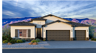
Marilyn II Craftsman Tile Roof

Homes may be built in reverse of plans shown, depending on site conditions. Minor architectural changes may be made occasionally at the option of the builder. Printed material is not date stamped. Prices are subject to change. Please reference Abrazo Homes' website for most updated and accurate pricing and information. Please contact your Sales Consultant for details.