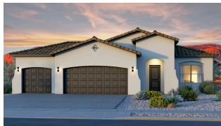
Tabitha II Mission 3 Car Tile Roof