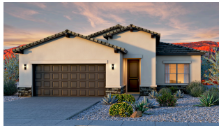
Tabitha II Craftsman Tile Roof