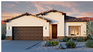
Tabitha II Craftsman_4th bedroom_Tile