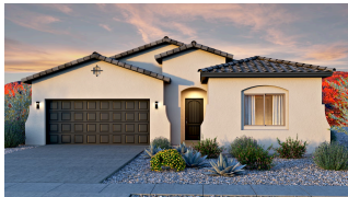
Tabitha II Mission Jr. Suite Tile Roof