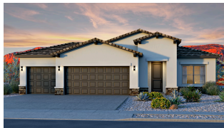
Tabitha III_Craftsman_4th bedroom_3 Car_Tile