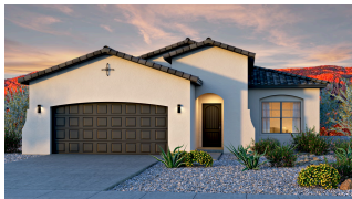
Tabitha II Mission Tile Roof