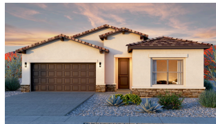
Tabitha II Craftsman Jr. Suite Tile Roof

Homes may be built in reverse of plans shown, depending on site conditions. Minor architectural changes may be made occasionally at the option of the builder. Printed material is not date stamped. Prices are subject to change. Please reference Abrazo Homes' website for most updated and accurate pricing and information. Please contact your Sales Consultant for details.