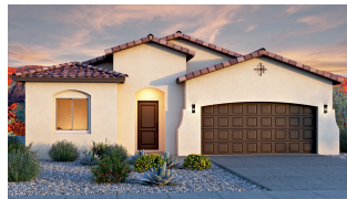
Tabitha II Mission 4th Bedroom Tile Roof