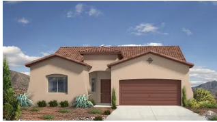
Selena Mission Tile Roof

Introducing the Selena, our charming single-story 3-bedroom, 2-bathroom home, thoughtfully designed for simplicity and comfort. Revel in the spacious primary suite featuring a generous walk-in closet, providing both luxury and functionality. The design allows natural light to illuminate the house, creating a bright and inviting atmosphere. The layout exudes a cozy vibe, while a recessed patio offers a private oasis. Enjoy sipping coffee or basking in New Mexico's beautiful weather in your secluded outdoor haven. Welcome to a quaint retreat that embraces both style and serenity. In honor of Selena Quintanilla-Perez, this residence pays tribute to enduring musical talent and cultural impact.