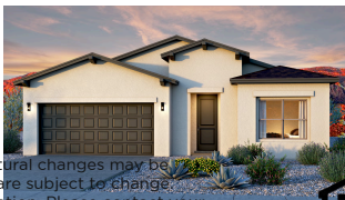
Tabitha II Craftsman w/out Stone 4th Bedroom Shingle Roof

Homes may be built in reverse of plans shown, depending on site conditions. Minor architectural changes may be made occasionally at the option of the builder. Printed material is not date stamped. Prices are subject to change. Please reference Abrazo Homes' website for most updated and accurate pricing and information. Please contact your Sales Consultant for details.