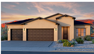
Tabitha II Craftsman w/out Stone 3Car Shingle Roof