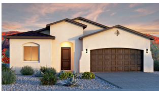
Tabitha II Mission 4th Bedroom Shingle Roof