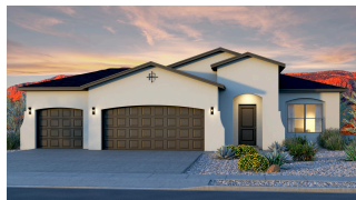
Tabitha II Mission 3 Car Shingle Roof