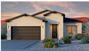
Tabitha II Craftsman w/out Stone Shingle Roof