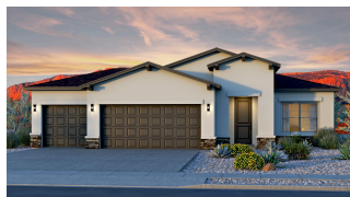
Tabitha II Craftsman 3Car Shingle Roof