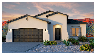
Tabitha II Mission Shingle Roof