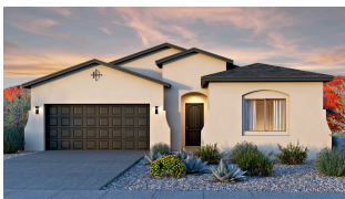
Tabitha II Mission Junior Suite Shingle Roof