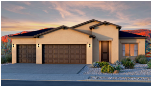
Tabitha II Craftsman w/out Stone 3Car Shingle Roof