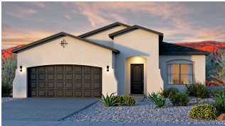
Tabitha II Mission Shingle Roof