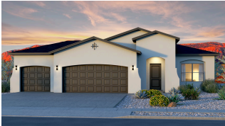
Tabitha II Mission 3 Car Shingle Roof