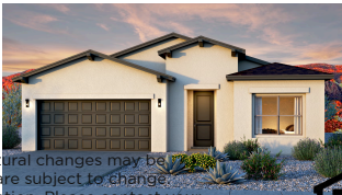
Tabitha II Craftsman w/out Stone 4th Bedroom Shingle Roof

Homes may be built in reverse of plans shown, depending on site conditions. Minor architectural changes may be made occasionally at the option of the builder. Printed material is not date stamped. Prices are subject to change. Please reference Abrazo Homes' website for most updated and accurate pricing and information. Please contact your Sales Consultant for details.