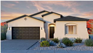
Tabitha II Mission Junior Suite Shingle Roof