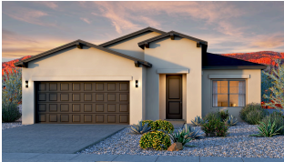
Tabitha II Craftsman w/out Stone Shingle Roof