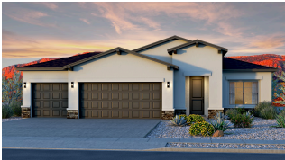
Tabitha II Craftsman 3Car Shingle Roof