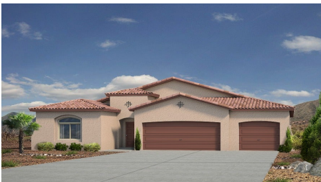
Tile Roof - Mission

Introducing the “Marilyn II”, our single-story ranch-style home designed for effortless living and entertaining. This ready-to-build floor plan seamlessly connects a spacious great room to a modern kitchen, creating the ideal space for gatherings. Featuring three bedrooms plus a flexible room, there's ample space for family or guests. Elevate your living experience with the option for a great room extension, and relish outdoor living on the large expanded patio available in many of our communities. Welcome to a home that harmonizes style with practicality. In honor of Marilyn Monroe, this residence celebrates glamor and enduring charm.