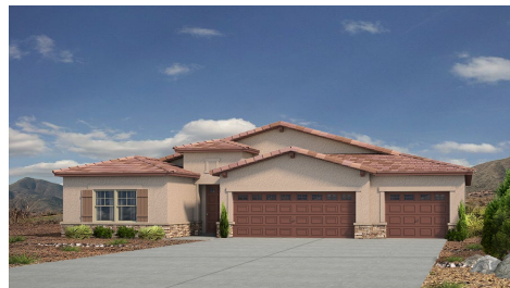
Tile Roof - Craftsman

Homes may be built in reverse of plans shown, depending on site conditions. Minor architectural changes may be made occasionally at the option of the builder. Printed material is not date stamped. Prices are subject to change. Please reference Abrazo Homes' website for most updated and accurate pricing and information. Please contact your Sales Consultant for details.