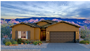
Jane Craftsman Tile Roof

Homes may be built in reverse of plans shown, depending on site conditions. Minor architectural changes may be made occasionally at the option of the builder. Printed material is not date stamped. Prices are subject to change. Please reference Abrazo Homes' website for most updated and accurate pricing and information. Please contact your Sales Consultant for details.