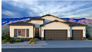
Marilyn II Craftsman Tile Roof