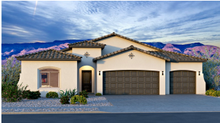
Marilyn II Mission Tile Roof

Introducing the "Marilyn II", our single-story ranch-style home designed for effortless living and entertaining. This ready-to-build floor plan seamlessly connects a spacious great room to a modern kitchen, creating the ideal space for gatherings. Featuring three bedrooms plus a flexible room, there's ample space for family or guests. Elevate your living experience with the option for a great room extension, and relish outdoor living on the large expanded patio available in many of our communities. Welcome to a home that harmonizes style with practicality. In honor of Marilyn Monroe, this residence celebrates glamor and enduring charm.