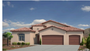
Marilyn II Mission Tile Roof