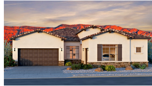
Victoria Craftsman w/3 Car Garage Tile Roof

Homes may be built in reverse of plans shown, depending on site conditions. Minor architectural changes may be made occasionally at the option of the builder. Printed material is not date stamped. Prices are subject to change. Please reference Abrazo Homes' website for most updated and accurate pricing and information. Please contact your Sales Consultant for details.