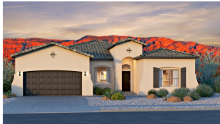
Victoria Mission Tile Roof

Meet the Victoria—Abrazo's flagship floor plan designed for flexibility and comfort. The open layout connects the living room, kitchen, and dining nook, creating an inviting space for entertaining or relaxing. The owner's suite features dual walk-in closets, and the secondary bedrooms share a Jack and Jill bath. Need more space? Add an optional junior suite/casita with a private exterior entrance—perfect for multi-generational living. With large sliding glass doors and plenty of natural light, the Victoria is a modern home with timeless appeal.