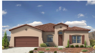
Victoria Mission Tile Roof