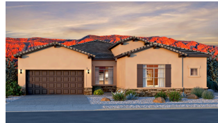
Victoria Craftsman Tile Roof