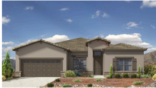
Victoria Craftsman Tile Roof