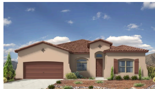
Victoria Mission Tile Roof