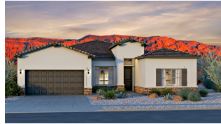
Victoria Craftsman w/Casita Tile Roof