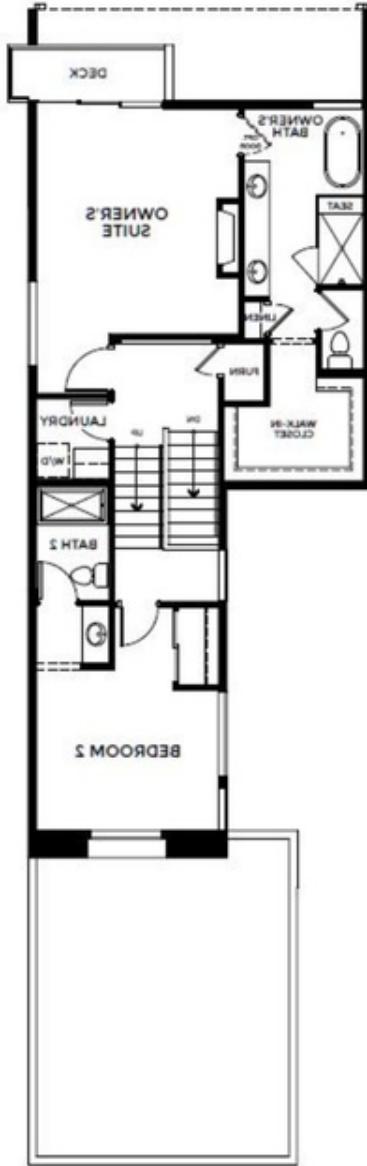
Primary Suite & Upstairs