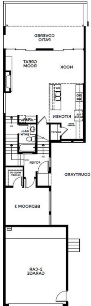
Entry Level & Downstairs

Homes may be built in reverse of plans shown, depending on site conditions. Minor architectural changes may be made occasionally at the option of the builder. Printed material is not date stamped. Prices are subject to change. Please reference Abrazo Homes' website for most updated and accurate pricing and information. Please contact your Sales Consultant for details.