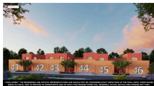
Zocalo Condos Units 41 - 46

**Disclaimer: Please note that the virtual tour below does not depict the exact layout of Unit #42. However, it serves as a visual aid and reference for the color and finish selections used in this unit. For a more accurate representation of the layout, please refer to the virtual tour of Unit #41, which more closely showcases the layout of Unit #42.