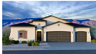
Marilyn II Mission Shingle Roof