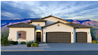
Marilyn II Mission Tile Roof

Introducing the "Marilyn II", our single-story ranch-style home designed for effortless living and entertaining. This ready-to-build floor plan seamlessly connects a spacious great room to a modern kitchen, creating the ideal space for gatherings. Featuring three bedrooms plus a flexible room, there's ample space for family or guests. Elevate your living experience with the option for a great room extension, and relish outdoor living on the large expanded patio available in many of our communities. Welcome to a home that harmonizes style with practicality. In honor of Marilyn Monroe, this residence celebrates glamor and enduring charm.