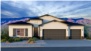
Marilyn II Craftsman Shingle Roof