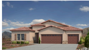
Marilyn II Craftsman Tile Roof

Homes may be built in reverse of plans shown, depending on site conditions. Minor architectural changes may be made occasionally at the option of the builder. Printed material is not date stamped. Prices are subject to change. Please reference Abrazo Homes' website for most updated and accurate pricing and information. Please contact your Sales Consultant for details.