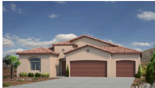
Marilyn II Mission Tile Roof