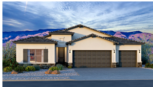
Marilyn II Craftsman Tile Roof