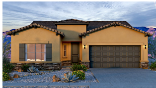
Selena Craftsman Tile Roof