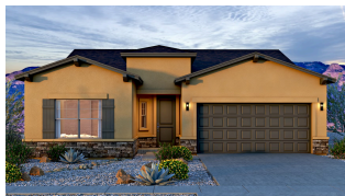
Selena Craftsman Shingle Roof