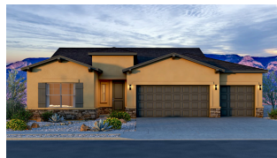
Selena Craftsman 3 Car Garage Shingle Roof

Homes may be built in reverse of plans shown, depending on site conditions. Minor architectural changes may be made occasionally at the option of the builder. Printed material is not date stamped. Prices are subject to change. Please reference Abrazo Homes' website for most updated and accurate pricing and information. Please contact your Sales Consultant for details.