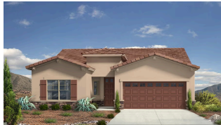
Selena Craftsman Shingle Roof