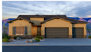
Selena Craftsman 3 Car Garage Tile Roof