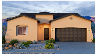
Selena Craftsman 3 Car Garage Shingle Roof