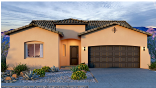
Selena Mission Tile Roof

Introducing the Selena, our charming single-story 3-bedroom, 2-bathroom home, thoughtfully designed for simplicity and comfort. Revel in the spacious primary suite featuring a generous walk-in closet, providing both luxury and functionality. The design allows natural light to illuminate the house, creating a bright and inviting atmosphere. The layout exudes a cozy vibe, while a recessed patio offers a private oasis. Enjoy sipping coffee or basking in New Mexico's beautiful weather in your secluded outdoor haven. Welcome to a quaint retreat that embraces both style and serenity. In honor of Selena Quintanilla-Perez, this residence pays tribute to enduring musical talent and cultural impact.