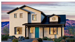
Northern New Mexican Elevation

Homes may be built in reverse of plans shown, depending on site conditions. Minor architectural changes may be made occasionally at the option of the builder. Printed material is not date stamped. Prices are subject to change. Please reference Abrazo Homes' website for most updated and accurate pricing and information. Please contact your Sales Consultant for details.