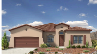
Victoria Mission Tile Roof