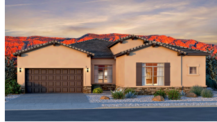
Victoria Craftsman Tile Roof