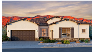
Victoria Craftsman w/3 Car Garage Tile Roof

Homes may be built in reverse of plans shown, depending on site conditions. Minor architectural changes may be made occasionally at the option of the builder. Printed material is not date stamped. Prices are subject to change. Please reference Abrazo Homes' website for most updated and accurate pricing and information. Please contact your Sales Consultant for details.